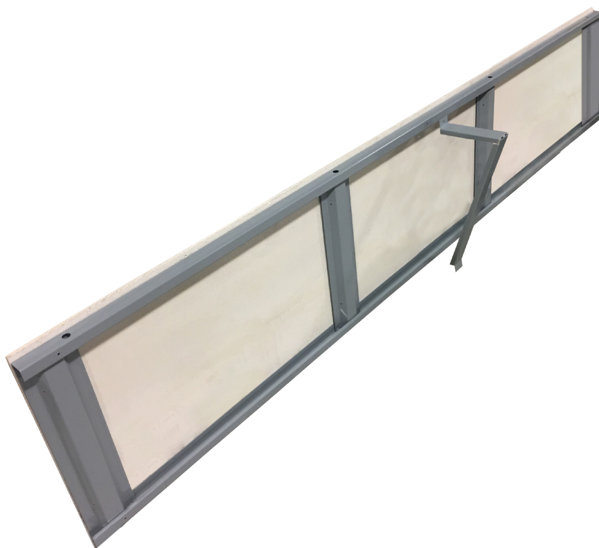
Fig. 2 Mounting the "7" bracket to each side panel.

The "7" bracket will mount in the center of each side panel as shown in Fig. 2. Use one self-tapping screw at the top and one self-tapping screw at the bottom of each side panel.